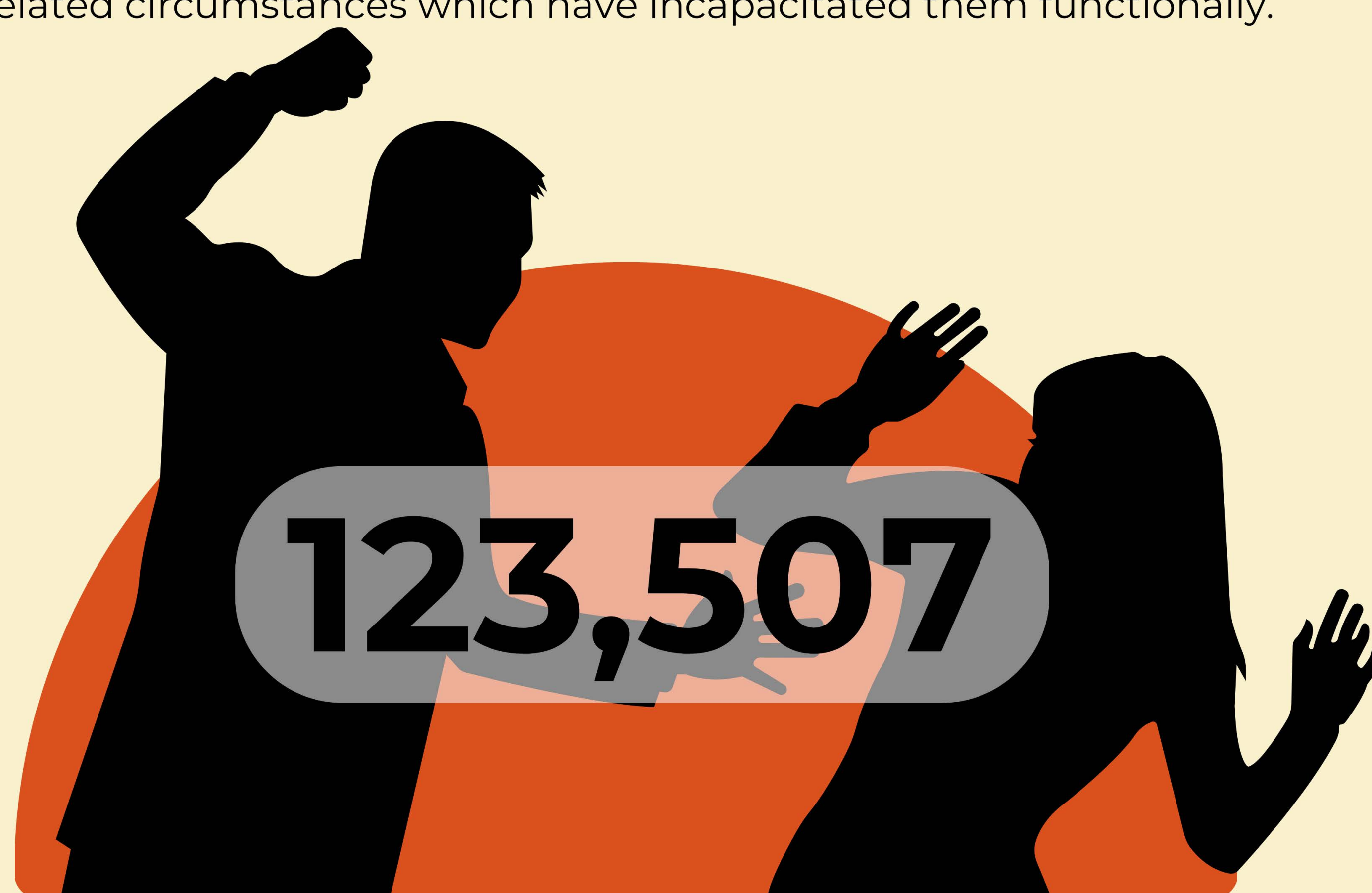
Total number of WEDC in region 02

Women in Especially Difficult Circumstances (WEDC) refer to victims and survivors of sexual and physical abuse, illegal recruitment, prostitution, trafficking, armed conflict, women in detention, victims and survivors of rape and incest, and such other related circumstances which have incapacitated them functionally.