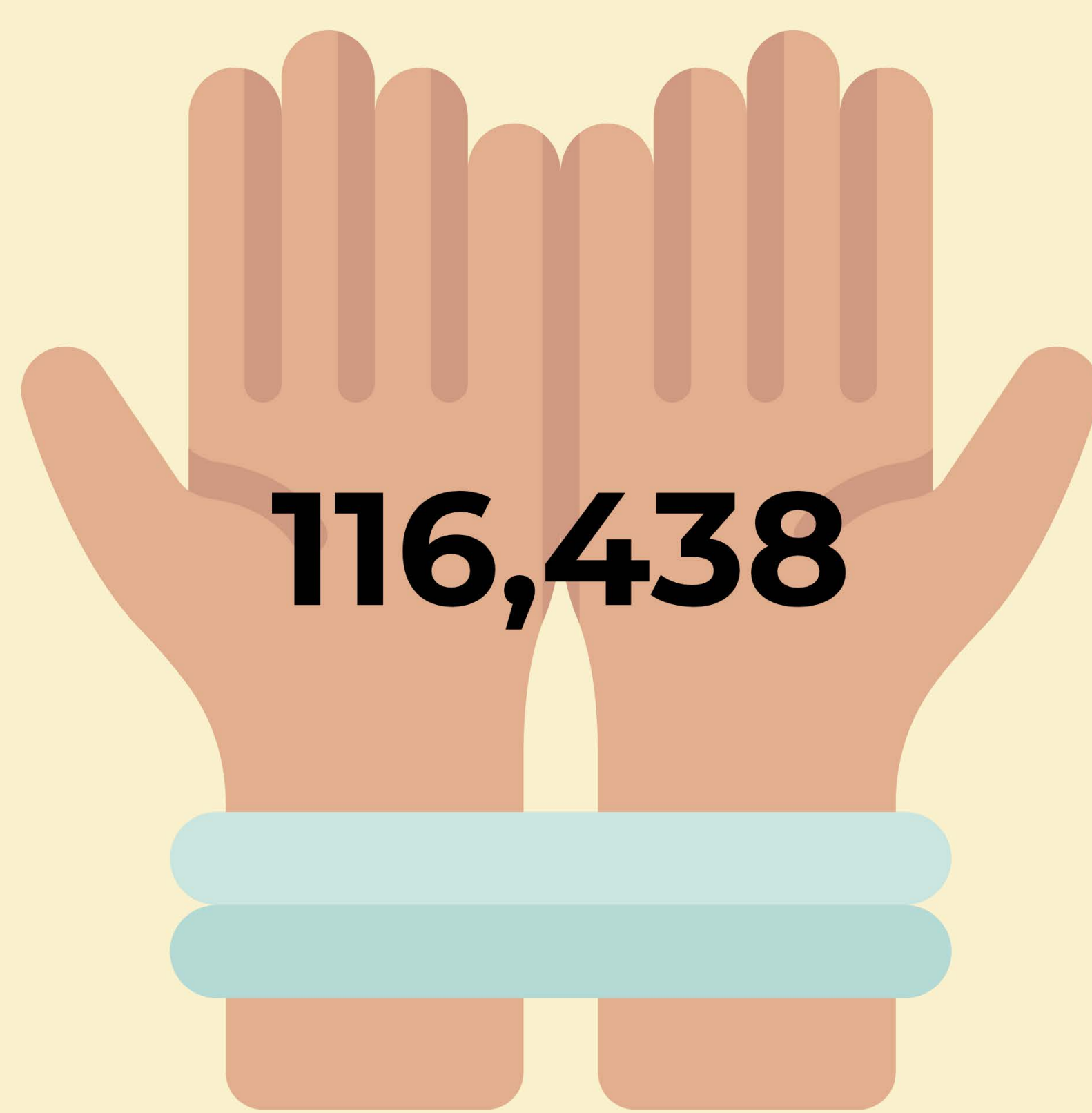
Family Heads and Other Needy Adults (FHONA)