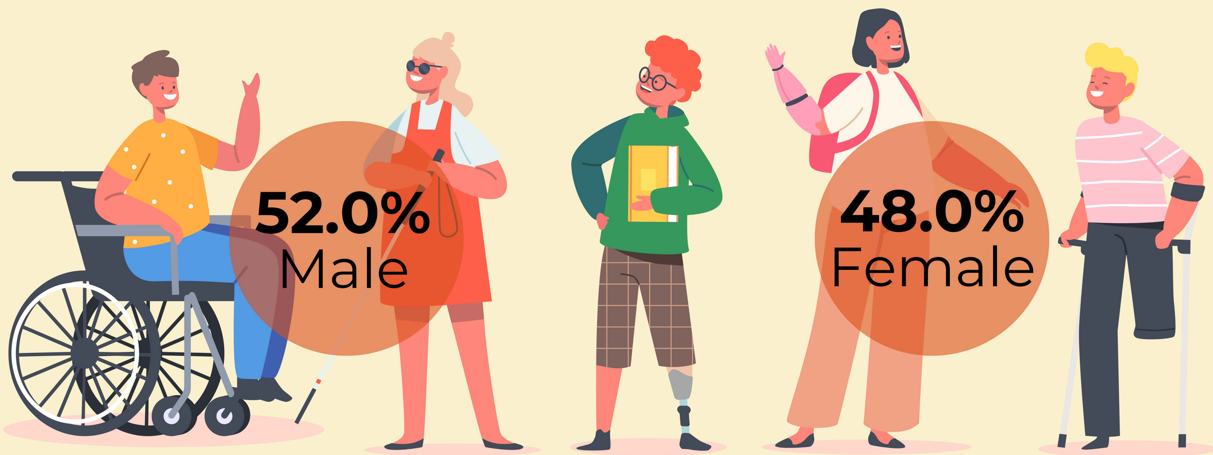
Persons with Disability