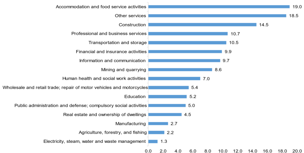
Figure 1. Cagayan Valley, Growth Rates by Industry: 2022-2023 At Constant 2018 Prices, in Percent

Among the 16 industries, the top industry that recorded the fastest growth was Accommodation and food service activities with 19.0 percent. This was followed by Other services, 18.5 percent; Construction, 14.5 percent; Professional and business services, 10.7 percent, and Transportation and storage, 10.5 percent. All remaining industries also posted growth in 2023. (Figure 1)