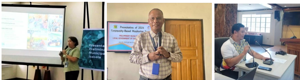
Snapshots during CBMS Data Presentation from various municipalities within the region.

08 August 2025 – TUGUEGARAO CITY, CAGAYAN. The Philippine Statistics Authority – Regional Statistical Services Office II (PSA RSSO II) successfully completed its 2024 Community-Based Monitoring System (preliminary results) data presentations to all 93 municipalities in the Cagayan Valley Region as of 08 August 2025.