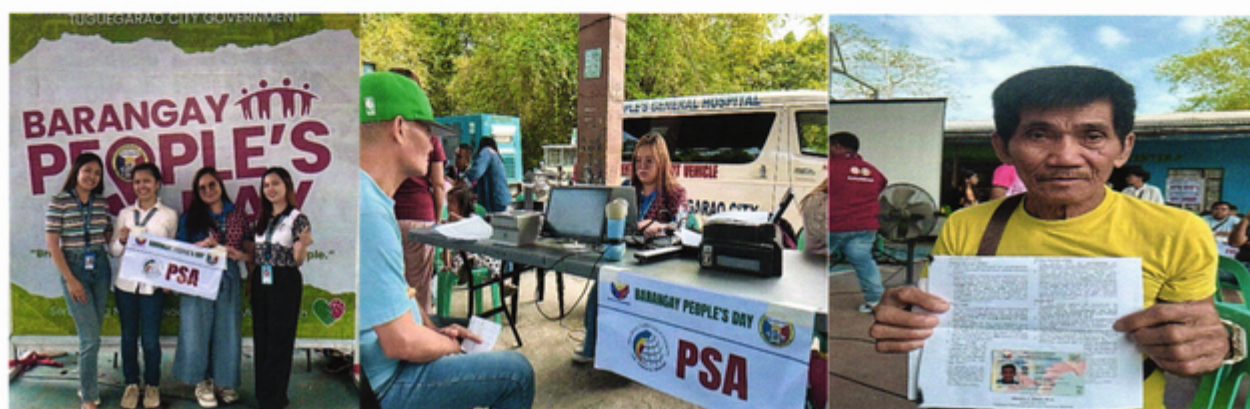
PSA Personnel during the People's Day at Pengue Ruyu, Tuguegarao City, Cagayan.

Date of Release: 24 March 2025 Reference No.: 2025RO215-PR012