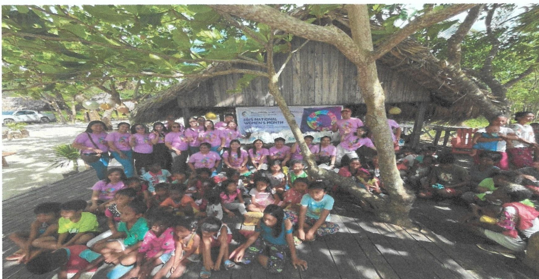
PSA Cagayan personnel, alongside the Aeta community of Sitio Pananacpan, Barangay Patunungan, Sta. Ana, Cagayan, pose for a picture together during the event.

29 March 2025 – Sta. Ana, Cagayan. In celebration of National Women's Month, the Philippine Statistics Authority – Cagayan Provincial Statistical Office (PSA Cagayan) organized a heartwarming gift-giving event for the Aeta community, reaffirming its dedication to inclusivity and social responsibility.