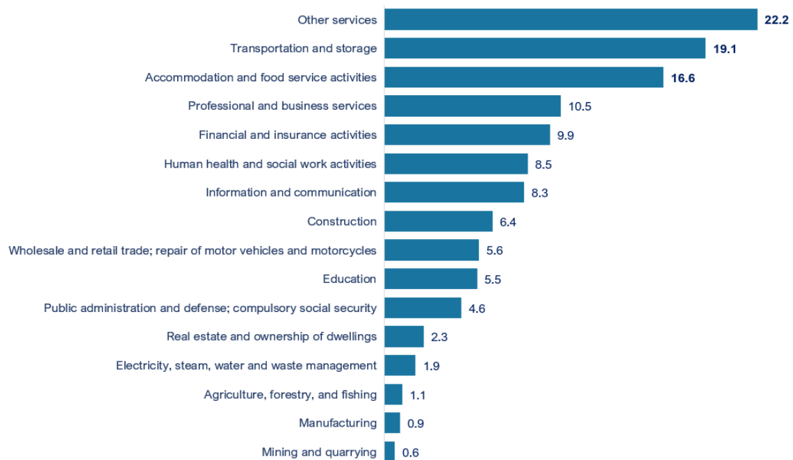
Figure 2. Economic Performance of Quirino, by Industry In Terms of Growth Rate (in Percent), 2022 to 2023 At Constant 2018 Prices

Among the industries, the fastest growth was observed in Other services, with 22.2 percent, followed by Transportation and storage, with 19.1 percent, and Accommodation and food service activities, with 16.6 percent. (Figure 2)