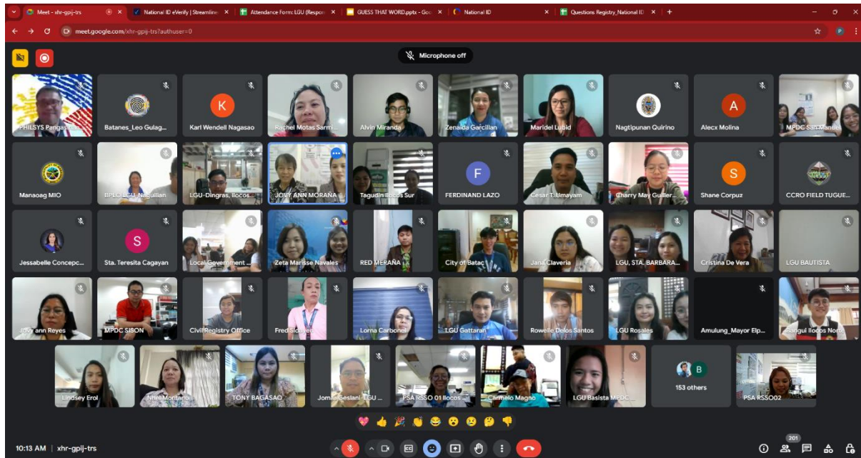
Participants post for a photo documentation during the National ID Authentication Services for Local Government Units webinar

Date of Release: 18 September 2024 Reference No. PR-2024-048