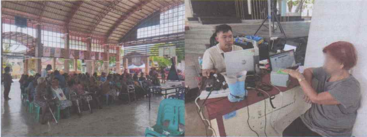
Senior Citizens line up to register for their National ID during the first day of the mobile registration at LGU Multipurpose Hall, Dupax del Sur, Nueva Vizcaya on 03 June 2025.

Bayombong, Nueva Vizcaya – The Philippine Statistics Authority (PSA) Nueva Vizcaya Provincial Statistical Office conducted a week-long mobile registration with the Local Government Unit (LGU) of Bambang and Dupax del Sur, Nueva Vizcaya on 02-06 June 2025.