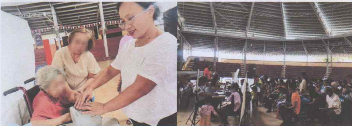
Senior citizens of LGU Bambang, Nueva Vizcaya queuing to register to the National ID System at Bambang Auditorium, Bambang, Nueva Vizcaya on 05 June 2025.

In an effort to register the remaining unregistered individuals—especially senior citizens—from both LGUs of Bambang and Dupax del Sur, the National ID team, together with the LGUs' Municipal Social Welfare and Development Office (MSWDO), conducted a mobile registration and provided National ID services to the elderly residents of the municipalities. The mobile registration was held during the payout of the Social Pension for Indigent Senior Citizens (SPISC).