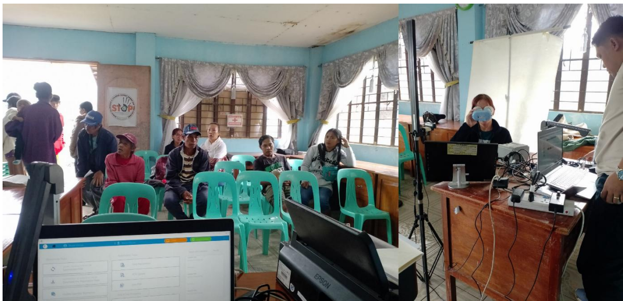
The National ID registration team during the conduct of mobile registration at Barangay Macalong, Kasibu on 10 February 2025. There were 30 individuals registered to the National ID system.