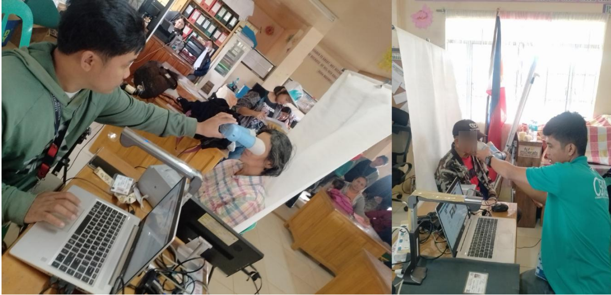
The National ID registration team capturing registrants' biometric information during the mobile registration at Barangay Tadjji, Kasibu on 26 February 2025. A total of 55 individuals registered to the National ID System during the activity.

The collaboration between PSO Nueva Vizcaya and MCRO Kasibu proved to be efficient in the registration process of the residents of Kasibu. By working together, the LGU and the PSO were able to ensure that more residents were included in the National ID system. This partnership significantly contributed to the realization of the goal to provide an inclusive identification system.