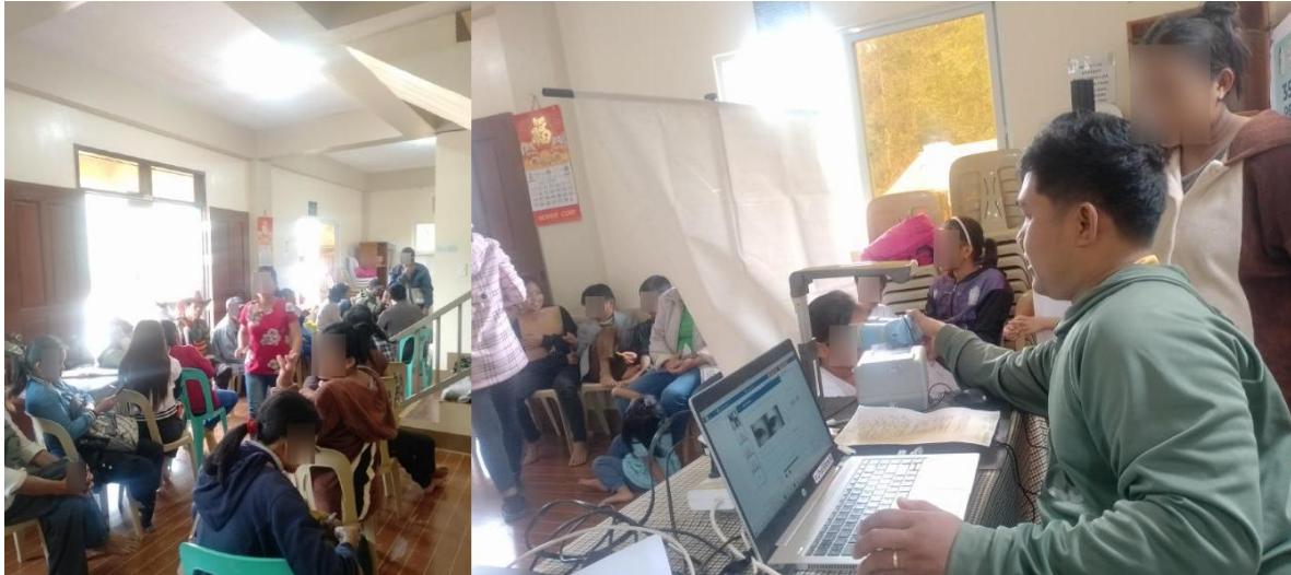
Residents of Barangay Bilet, Kasibu line up for queue during the National ID mobile registration at Barangay Bilet, Kasibu on 17 February 2025. The National ID registration team registered 100 individuals during the activity.