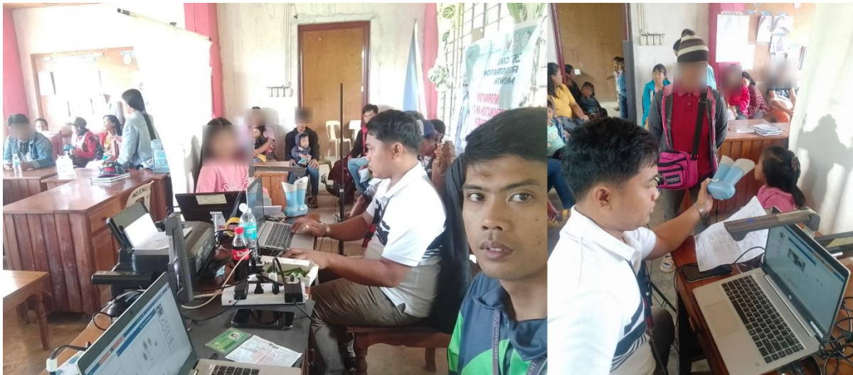
The National ID registration team during the conduct of mobile registration at Barangay Cordon, Kasibu on 18 February 2025. The team successfully registered 91 individuals to the National ID System.