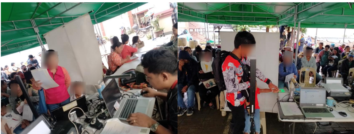
The National ID registration team conducted a mobile registration at LGU Grounds, Kasibu on 24-25 February 2025. The team registered 245 individuals during the two-day activity.