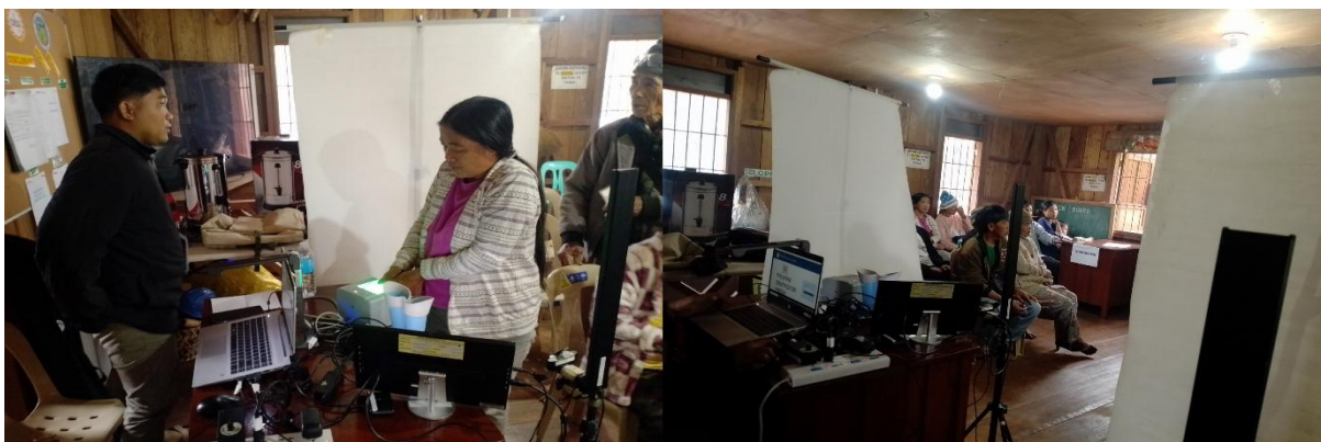
A resident of Barangay Camamasi, Kasibu registered to the National ID System during the mobile registration on 11 February 2025. A total of 65 individuals were registered during the activity.