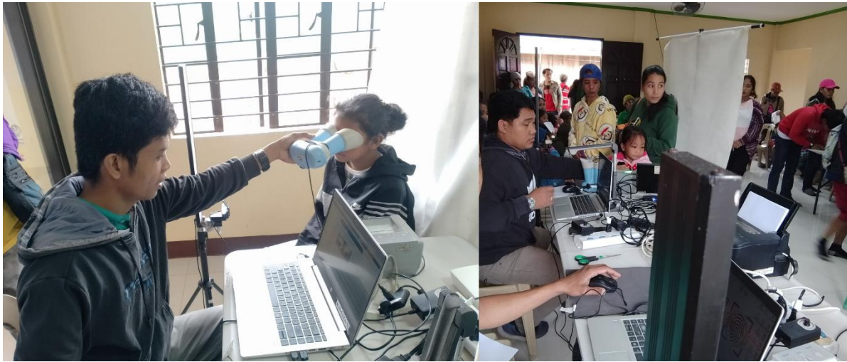
Photos during the conduct of National ID registration at Barangay Biyoy, Kasibu on 04 February 2025. A total of 86 individuals registered to the National ID System during the activity.