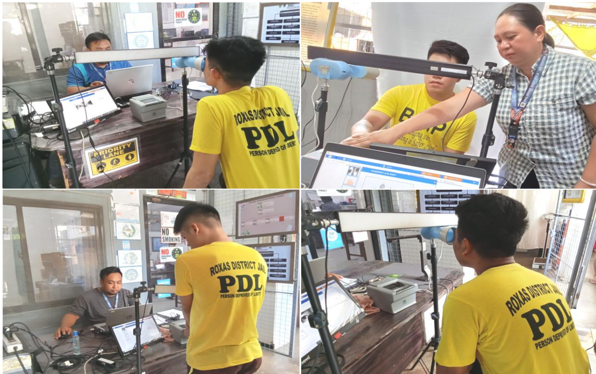
Persons Deprived of Liberty (PDLs) submit biometric information during their registration for the National ID.

ROXAS, ISABELA – The Philippine Statistics Authority (PSA) – Isabela Provincial Statistical Office (IPSO), in partnership with the Bureau of Jail Management and Penology (BJMP), successfully conducted a National ID registration activity on 02-03 June 2025 at the Roxas District Jail, Vira, Roxas, Isabela.