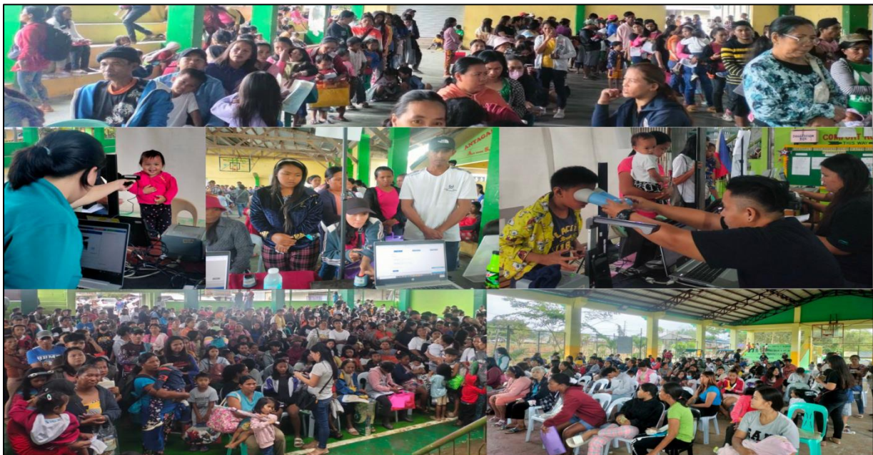
PSA National ID Team during the Registration and Authentication of DSWD 4Ps beneficiaries at Tumauni, Isabela

Date of Release: 11 March 2025 Reference No. PR-2025-3112