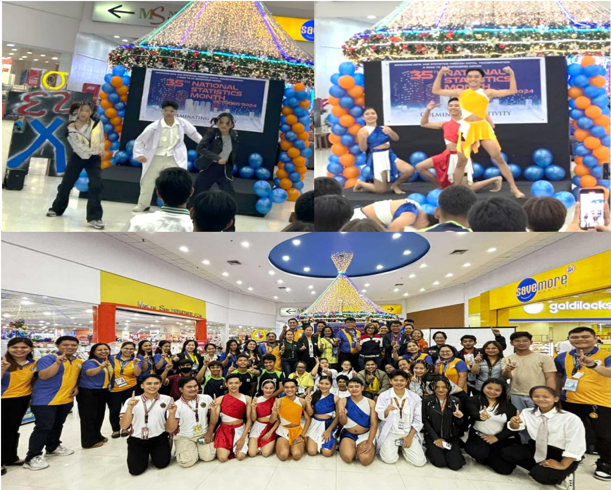
Top (left to right): Dance grooves of Casa Del Niño Montessori School – Ilagan in StaTiktok Dance Challenge and ISU-Cauayan Campus in the NSM Jingle Dance. Bottom: Participants to the 35 th NSM Culminating Activity.

Date of Release: 04 November 2024 Reference No. : PR-2024-3140