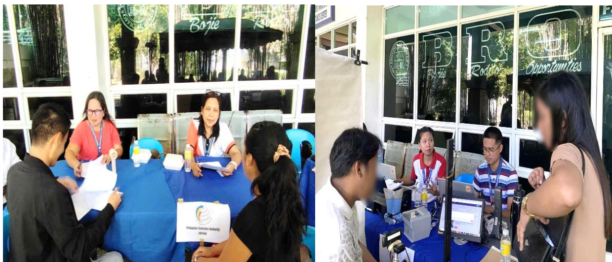
PSA – Isabela personnel, applicants and individuals availing services of PSA during the Job Fair at the Queen Isabela Park.

CITY OF ILAGAN, ISABELA – The Philippine Statistics Authority (PSA) – Isabela actively participated in the Job Fair spearheaded by the Public Employment Service Office (PESO) of the Provincial Government of Isabela on 01 August 2025, held at the Ground Floor of Queen Isabela Park, Provincial Capitol, City of Ilagan.