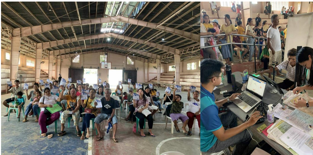
(Right) Residents of San Guillermo with National ID information leaflets provided to them while waiting in line for the services. (Left) PSA personnel facilitating the National ID registration.

SAN GUILLERMO, ISABELA – The Philippine Statistics Authority (PSA) – Isabela Provincial Statistical Office, in partnership with the Local Government Unit (LGU) of San Guillermo, successfully conducted National ID registration and other PSA related services on 8–9 July 2025 at Centro I, San Guillermo, Isabela.