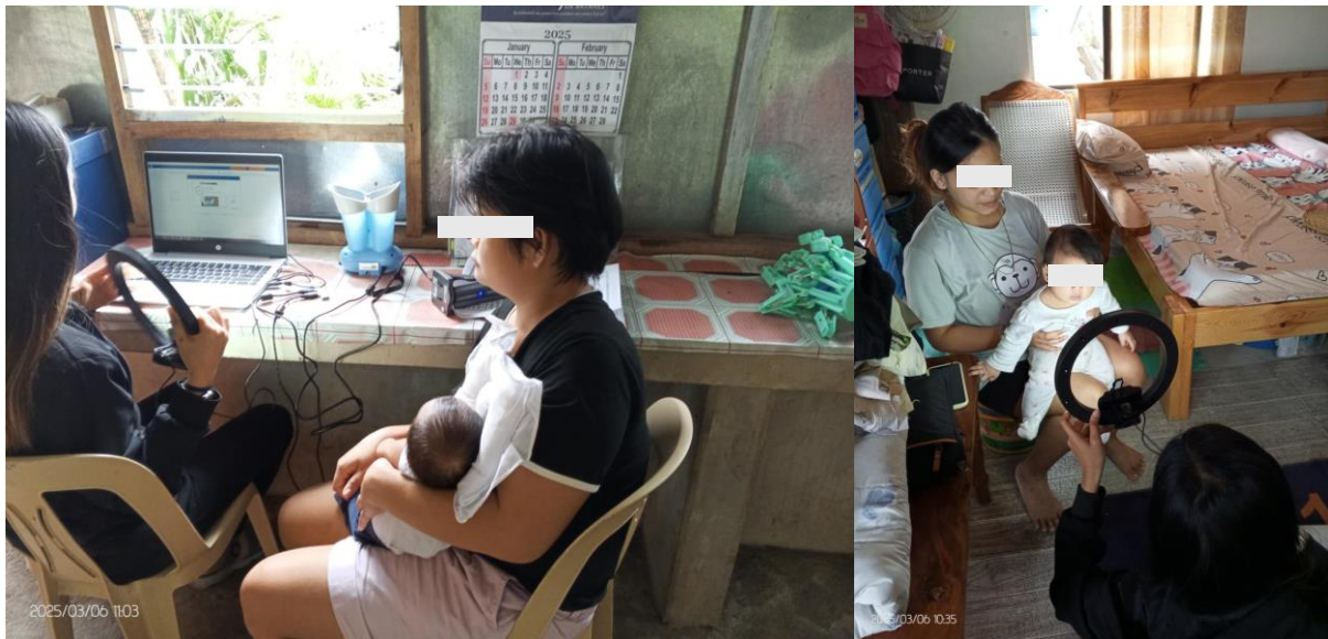
National ID Registration Team conducting house-to-house registration.

BASCO, BATANES. To promote comprehensive registration within the National ID System for all residents of Batanes, the Philippine Statistics Authority (PSA) Batanes is undertaking a house-to-house registration initiative. This program specifically addresses the need to register remaining populations, with particular emphasis on children under five years of age.