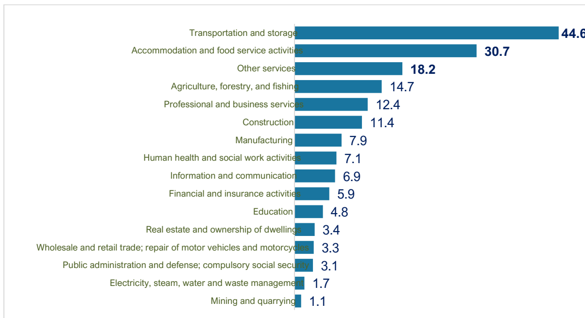
Figure 2. Economic Performance of Batanes, by Industry In Terms of Growth Rates (in Percent); 2022 to 2023 At Constant 2018 Prices

Among the 16 industries, fastest growths were observed in Transportation and storage with 44.6 percent, followed by Accommodation and food service activities with 30.7 percent, and Other services with 18.2 percent. (Figure 2)