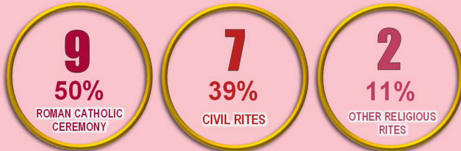
NUMBER OF REGISTERED MARRIAGES BY MUNICIPALITY: BATANES