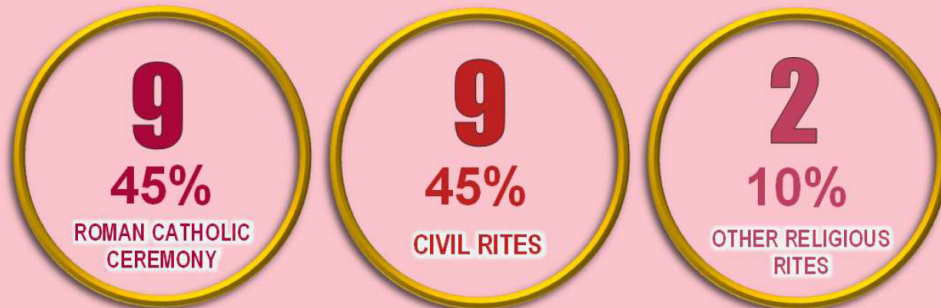
NUMBER OF REGISTERED MARRIAGES BY MUNICIPALITY: BATANES