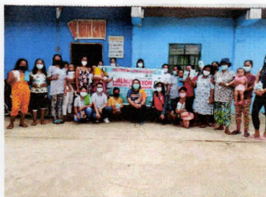
Feeding Program at Barangay San. Ignacio, City of Ilagan, Isabela with children 3 – 6 years of age