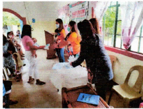
Personal Protective Equipment (PPE's) to lactating mothers

The Provincial Office of Isabela will continuously support the programs of the Department of Health (DOH) and the National Nutrition Council (NNC) by participating in its campaign to prevent malnutrition in the province.