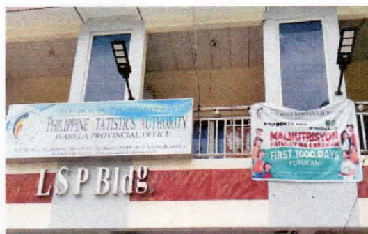
Hanging of the tarpaulin in the façade of the Philippine Statistics Authority Provincial Office Building